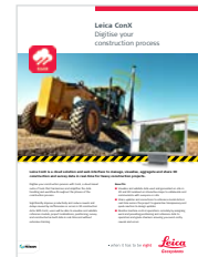
Leica ConX Flyer